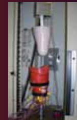
Fig. 6: Tensile tester with the mock residual limb along with the prosthetic socket attached.