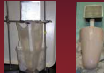
Fig. 4: (a) Set up and (b) finished product of the mock residual limb.